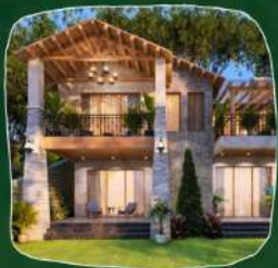
INDEPENDENT PLOTS & VILLAS